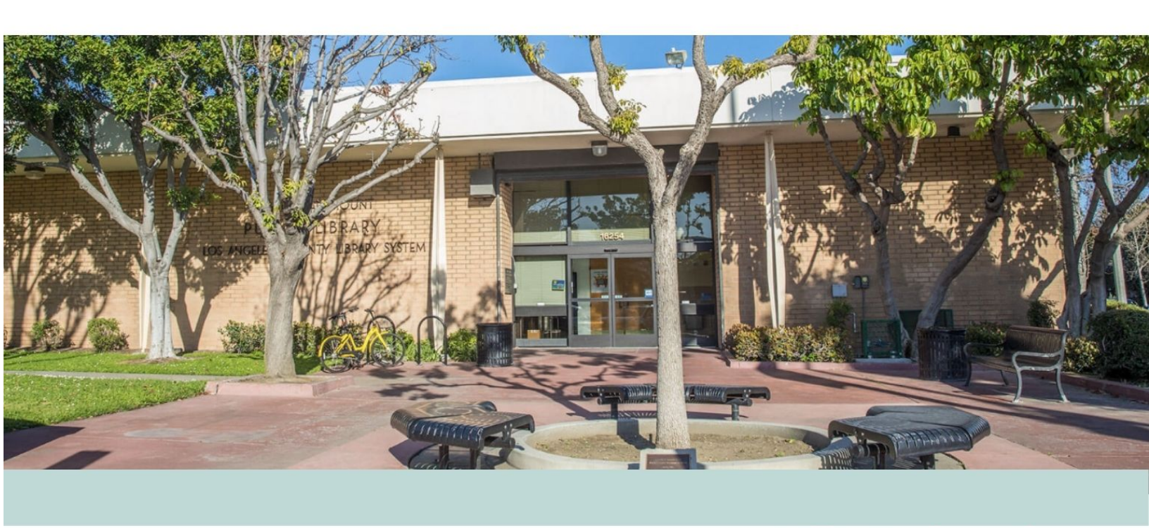
Public Facilities Element