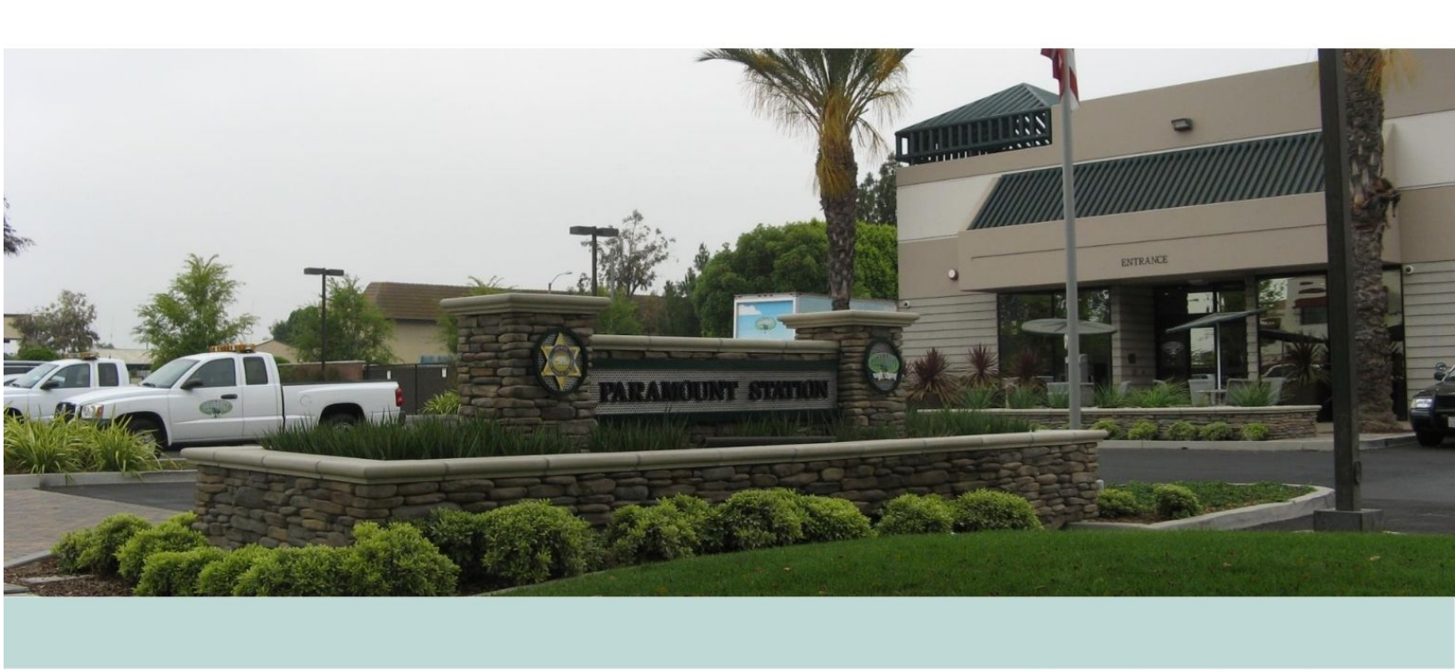
Health and Safety Element