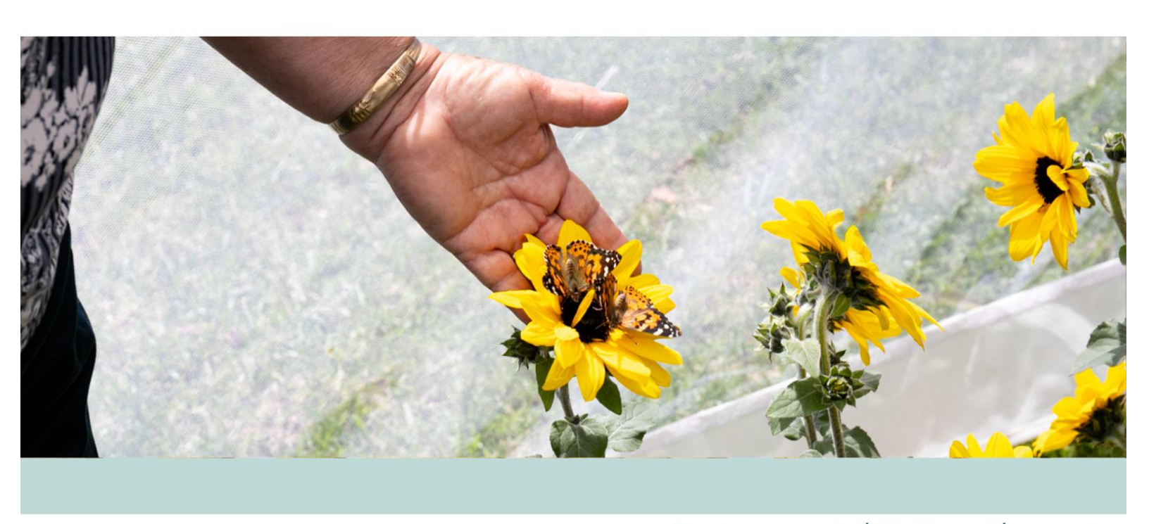
Environmental Justice Element