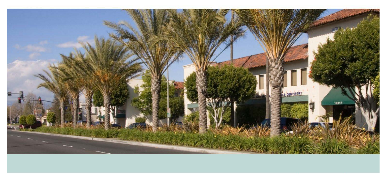
Economic Development Element